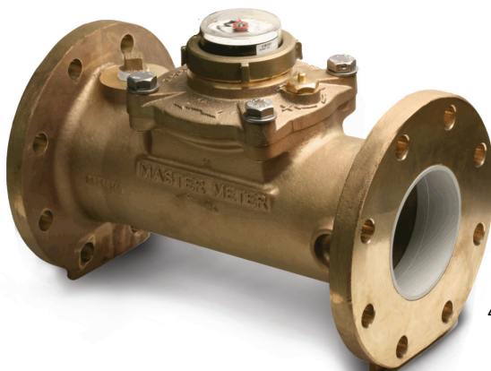
4" MMT pictured